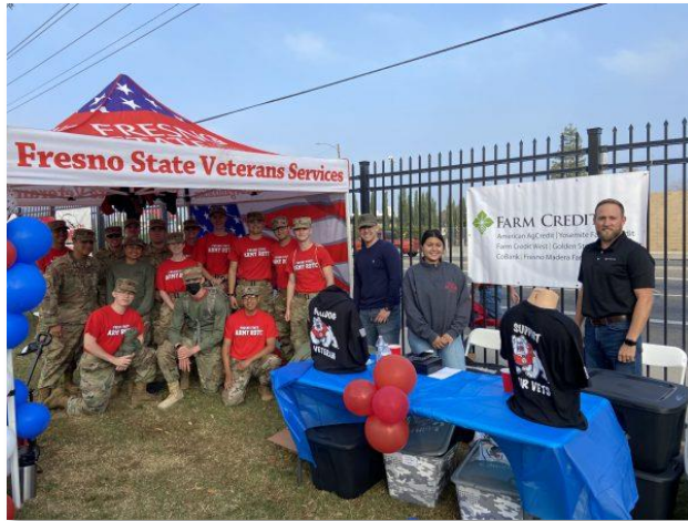
ROTC cadets and Farm Credit volunteers wait for the tacos to be ready at the annual Fresno State veterans' tailgate.

Farm Credit is the largest provider of credit to U.S. agriculture, but its support goes much deeper than that. Farm Credit is also committed to the sustainability and long-term viability of agriculture and rural communities and strongly supports non-profits working to preserve and protect California agriculture.